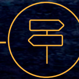
Leasing (with and without balloon for cars & LCVs)